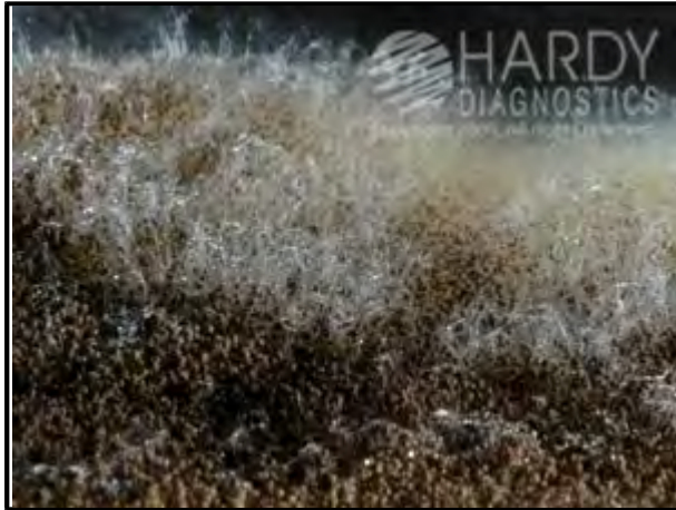
Aspergillus brasiliensis (ATCC ® 16404) growing on Malt Extract Agar (Cat. no. W28). Incubated aerobically for 7 days at 30°C.

Malt Extract Agar should appear clear, slightly opalescent, and light to medium amber in color.