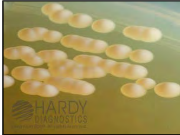
Candida albicans (ATCC ® 10231) colonies growing on Malt Extract Agar (Cat. no. W28). Incubated aerobically for 48 hours at 30°C.