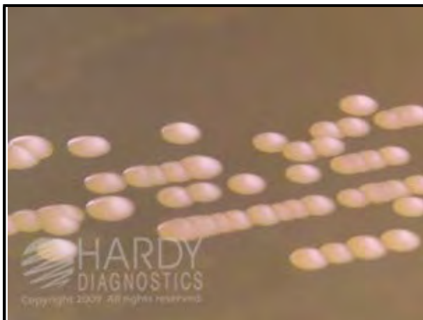
Saccharomyces cerevisiae (ATCC ® 9763) colonies growing on Malt Extract Agar (Cat. no. W28). Incubated aerobically for 48 hours at 30°C.